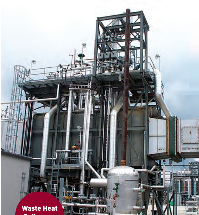
Waste Heat Boilers on Coke Ovens

N/E PROVIDES FOR MULTIPLE WASTE HEAT APPLICATIONS.