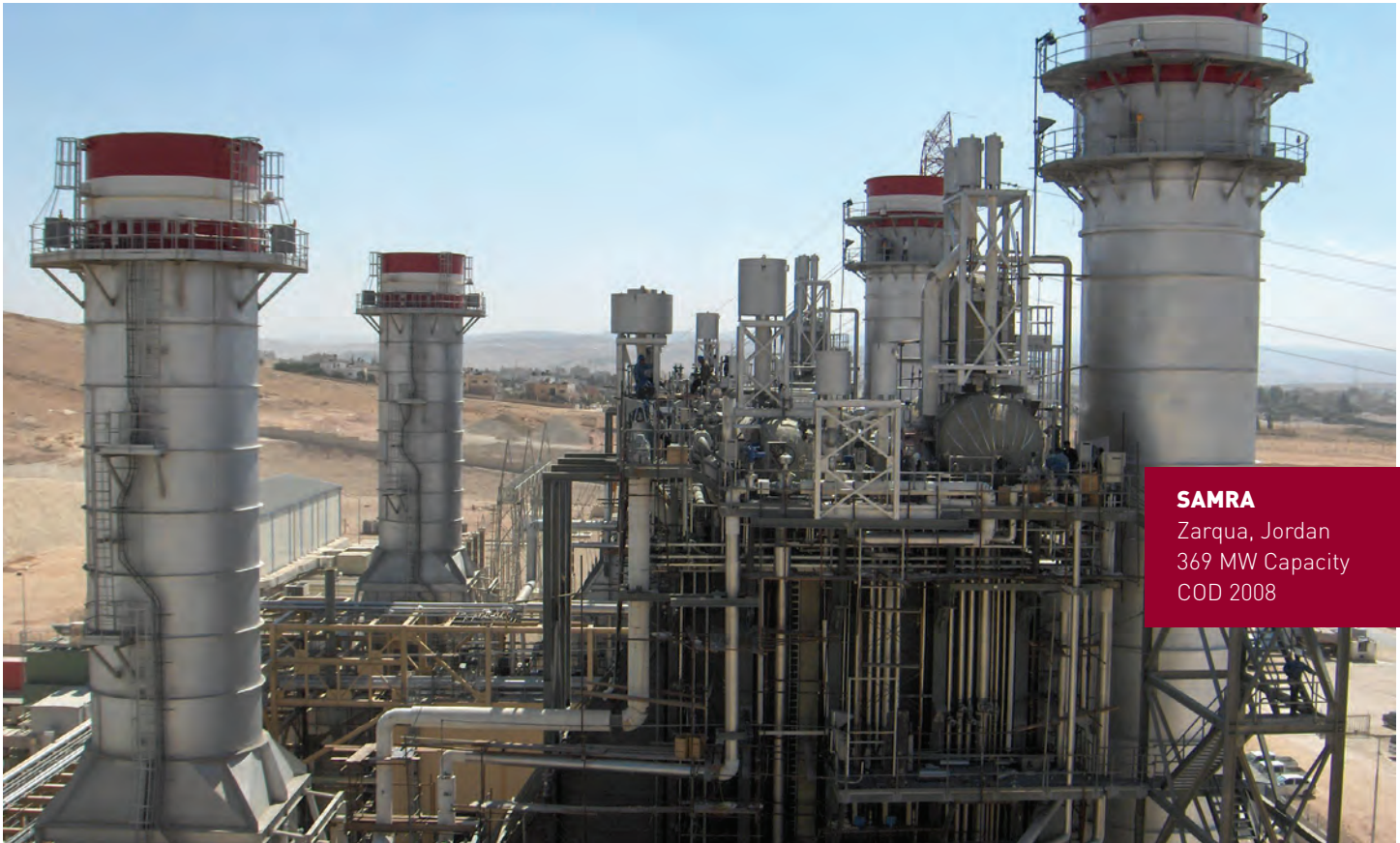
SAMRA Zarqua, Jordan 369 MW Capacity COD 2008