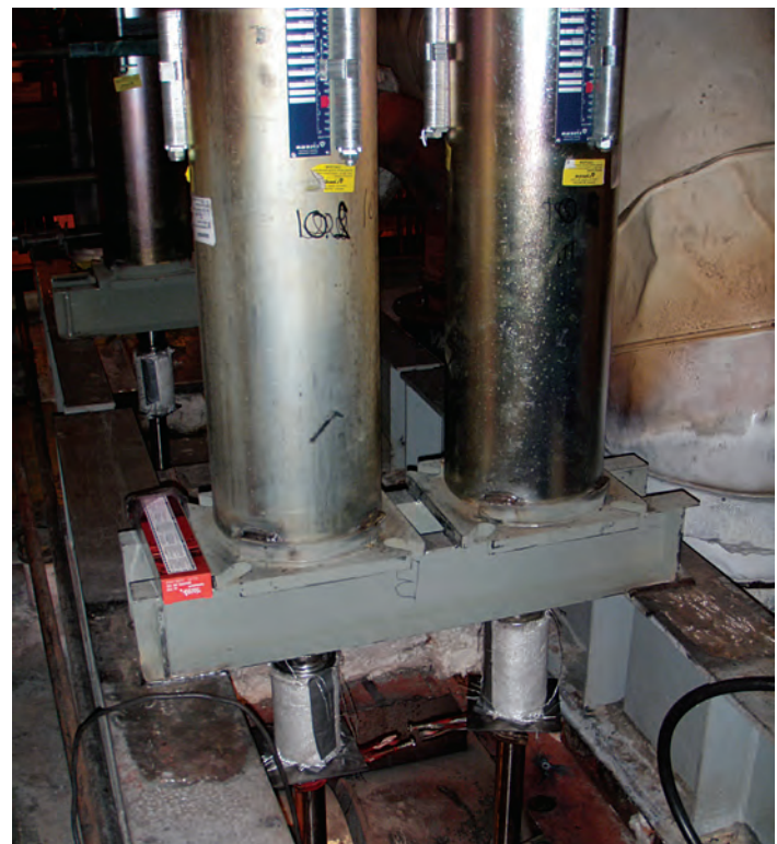
Coil Spring Support – Adds flexibility to the coil and minimizes future damage due to cycle fatigue. This is standard on more recent N/E HRSGs