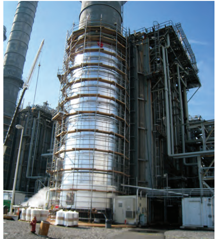
Stack Damper Retrofit – Enable plants to maintain a warm and hot start for longer periods of time.