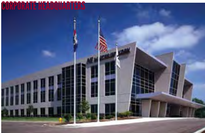
Nooter/Eriksen, Inc. USA (World headquarters)