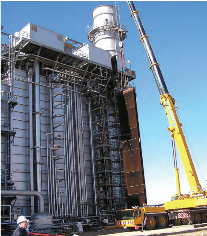
Coil Replacement – Restores reliability and performance to a coil with a widespread failure mechanism.