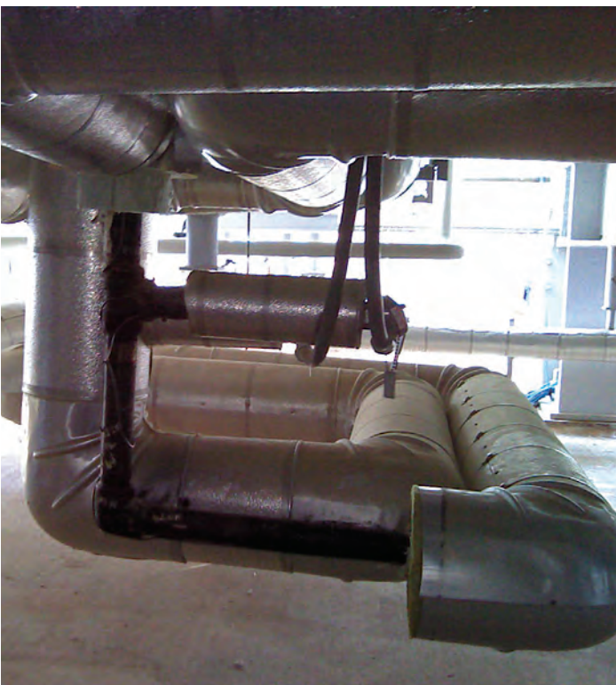
Automated Condensate Detection Retrofit – System for the automatic removal of condensate from drain lines now required by ASME Code.