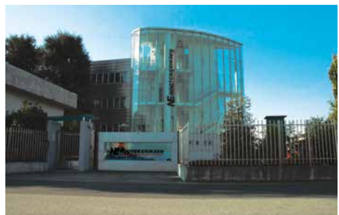
Nooter/Eriksen, SRL | Italy